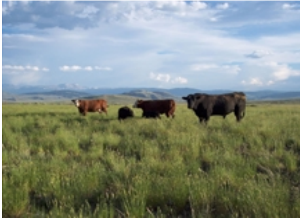
51 Acre Conservation Easement near Kremmling