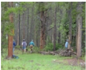
Volunteers working hard on stewardship day

Each year MPLT volunteers are invited to a property held under Conservation Easement to help the land owner with some of their land maintenance needs and we call it "Easement Stewardship Day". This year, Easement Stewardship Day was held on a 35 acre property near Fraser. Volunteers Brock and Angela McCormick arranged the day, with generous donations of food and drink from Pizza Hut and Safeway. A total of 12 people showed up to help, and did an amazing job clearing brush and cleaning up the property. THANK YOU VOLUNTEERS! We could not do this without you.