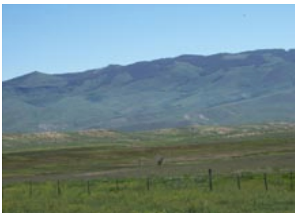
376 Acre Conservation Easement near Kremmling